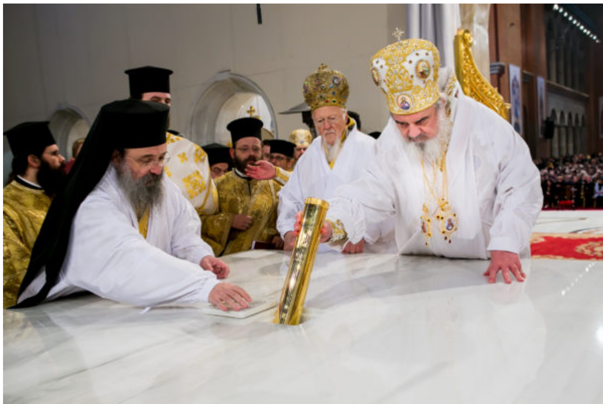
Ecumenical Patriarch Bartholomew and Patriarch Daniel consecrated the Holy Altar Table of the National Cathedral on Nov. 25, 2018.

Incorporated into the Holy Altar Table was a list of the names of all known Romanian heroes (approximately 350,000) to symbolically commemorate the cathedral's construction as a historical sacrifice of the Romanian people for faith, national independence, and freedom under God.