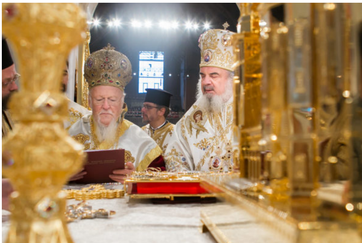
Ecumenical Patriarch Bartholomew and Patriarch Daniel officiating the consecration ceremony of the altar table of the National Cathedral, Nov. 25, 2018.

Thus, we understand that the first title under which this holy place is known – “The Romanian People’s Salvation Cathedral” – represents more of an identity symbol than a proper theological one.