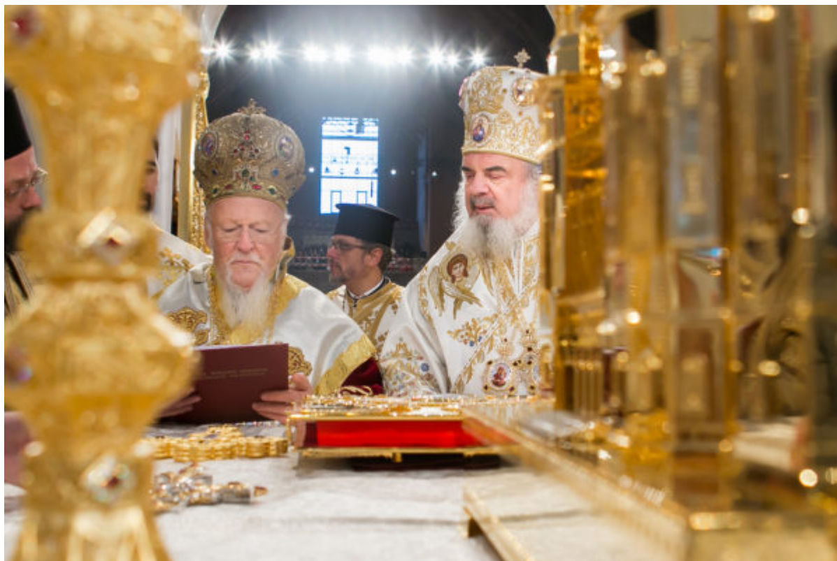
Ecumenical Patriarch Bartholomew and Patriarch Daniel officiating the consecration ceremony of the altar table of the National Cathedral, Nov. 25, 2018.

Thus, we understand that the first title under which this holy place is known – “The Romanian People’s Salvation Cathedral” – represents more of an identity symbol than a proper theological one.