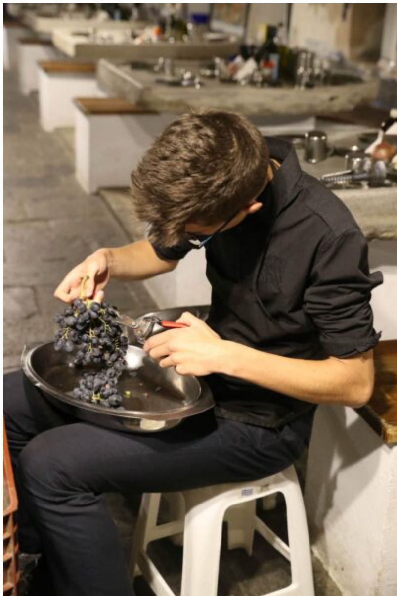
In the refectory