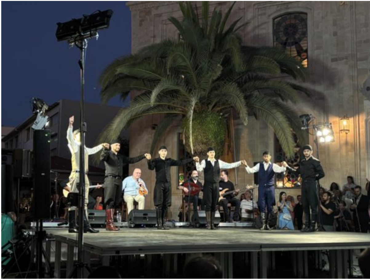
attendees e region's