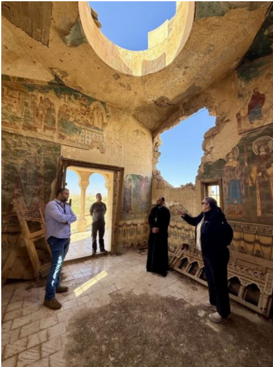
Romanian Skete at the Jordan River.

The projects currently underway include: