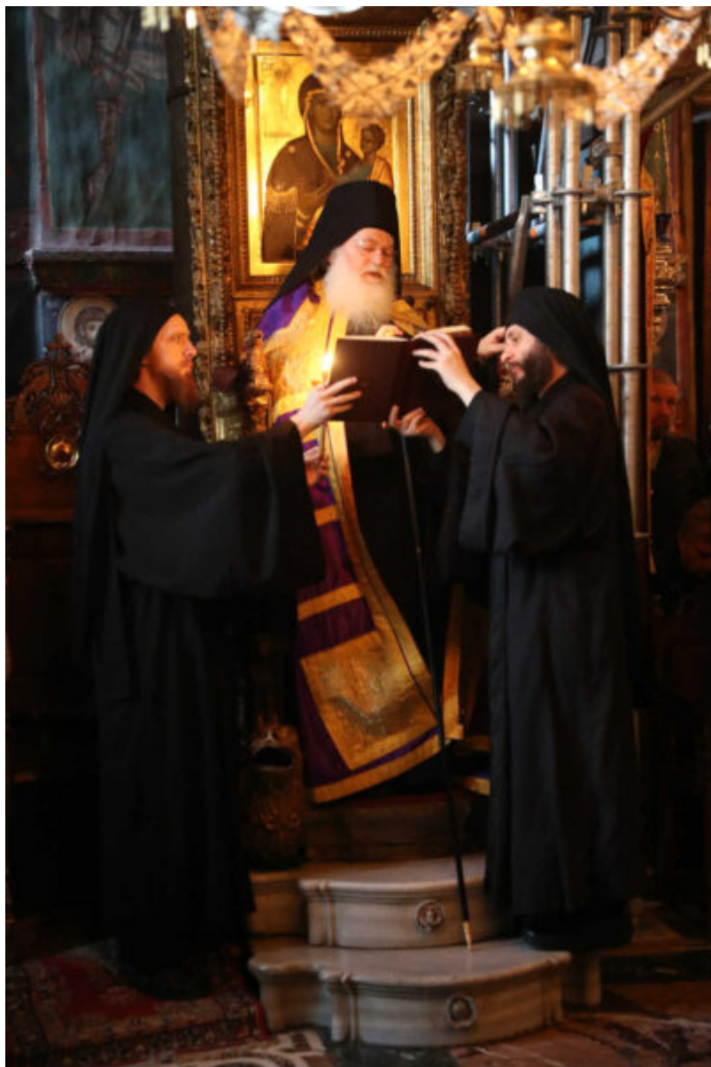
edi monastery, Mount Athos

That's why we have the Great Lent as a special period dedicated specially to tears.