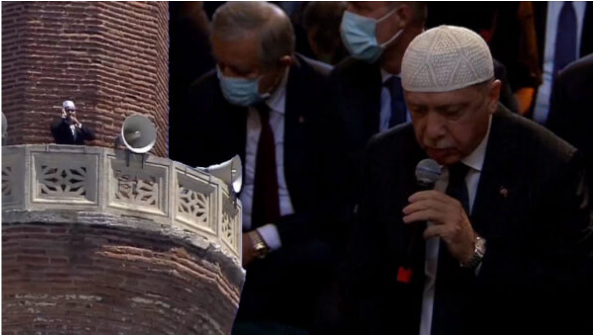
Erdogan recites holy Quran at Hagia Sophia iust before the first Friday