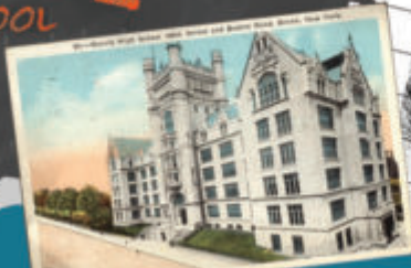
MORRIS HIGH SCHOOL