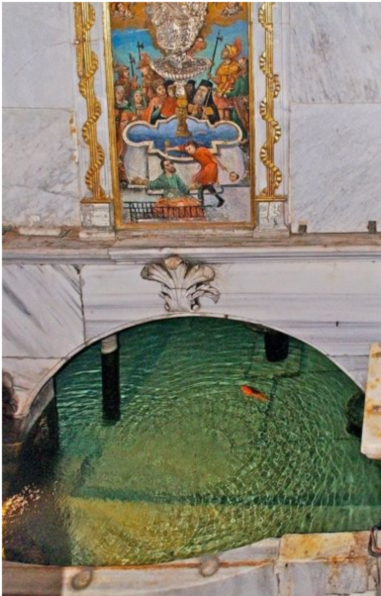
Orthodox Christianity in Australia