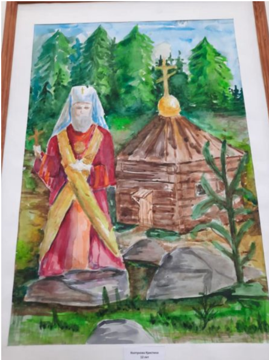
Святитель Иосиф 18 век