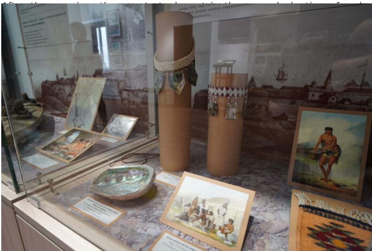
seedlings local folk

Among the items from the American delegation is copy of the Gospel of Matthew used by St. Innocent.