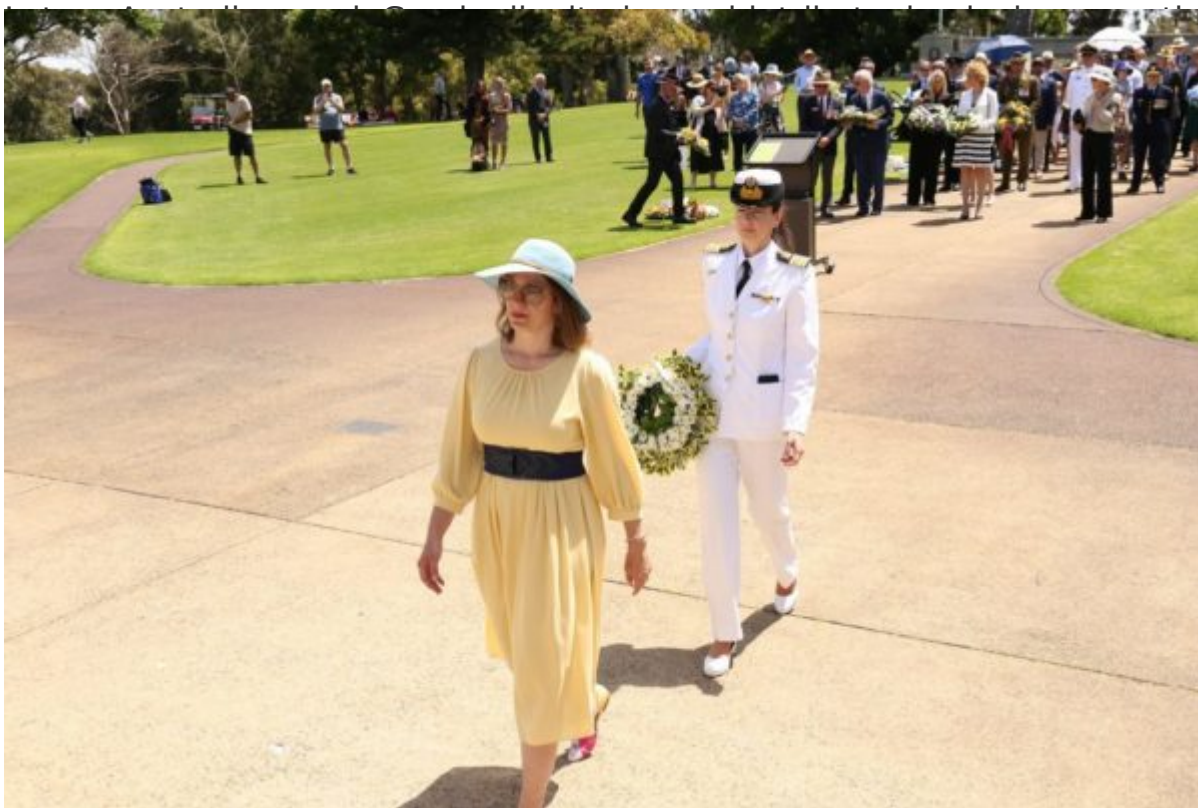
s and the Perth, Ms VA.