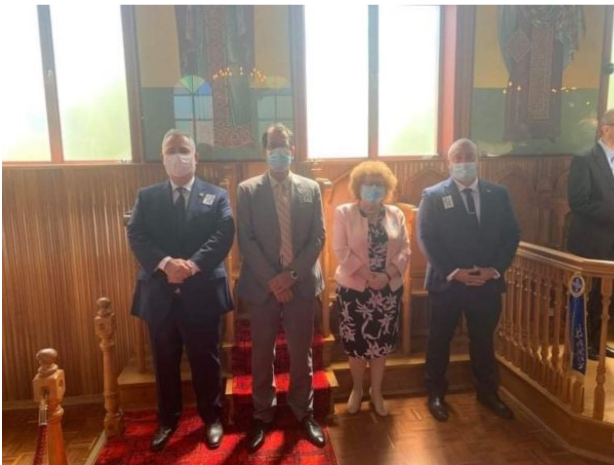
In attendance were a number of Greek community members including His