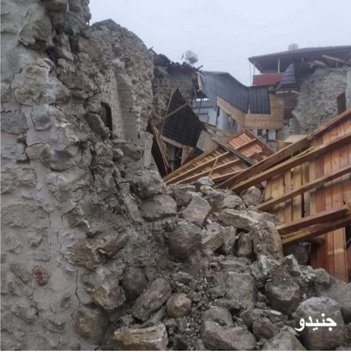
سكذوثرألا مورلل قرشملا رئاسو ةيكاظنا ةيكريرطب Antioch Patriarchate