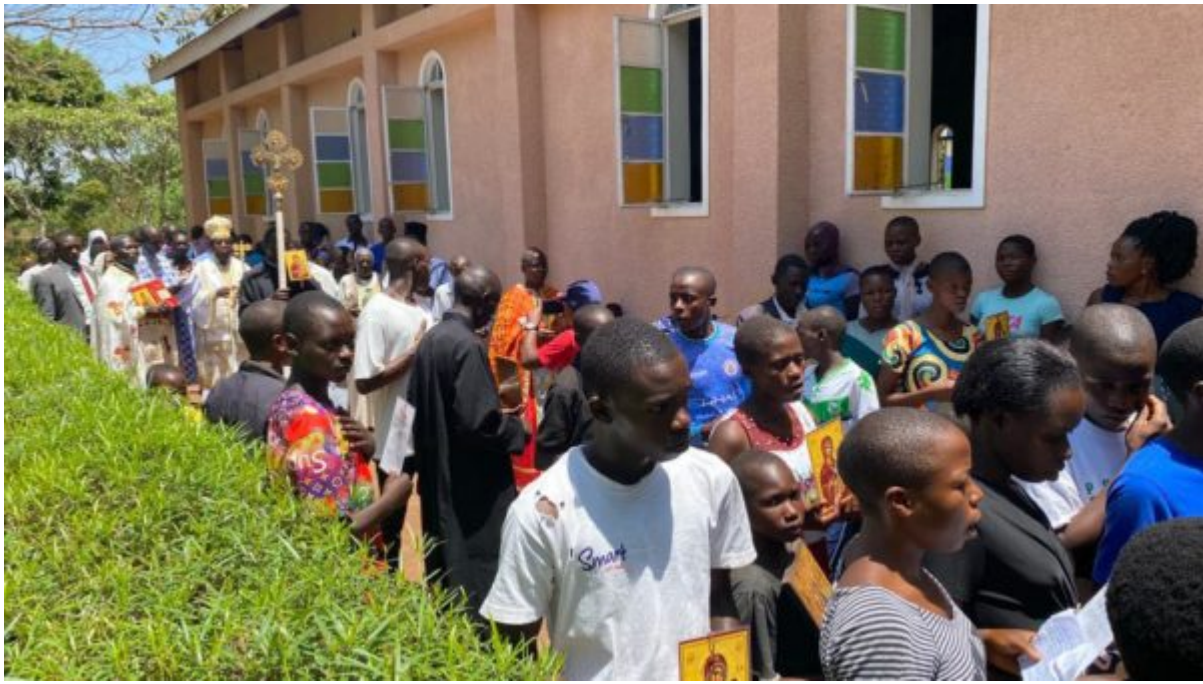
Uganda Orthodox Church – Holy Diocese of Jinja and Eastern Uganda